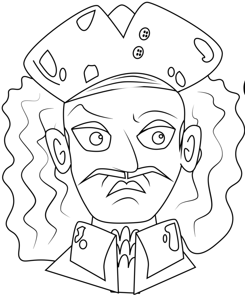
Captain Serpent Tyde